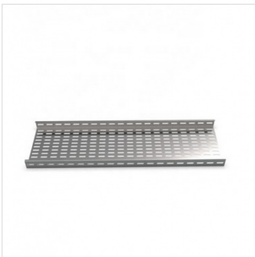
HXW Cable Tray Professional cable tray manufacturer